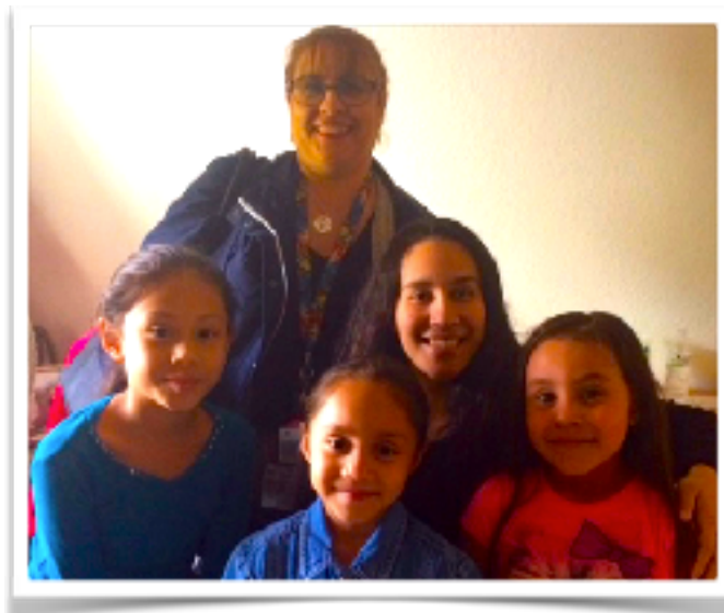
Graduates of the FAMCARES Home Visiting program!

The Home Visiting team enrolled 40 participants in the FAMCARES program. 4 completed all visits, 8 dropped, and 28 active were still actively receiving visits at the time of this report. Home visitors made 78 educational visits and 29 environmental assessment visits!